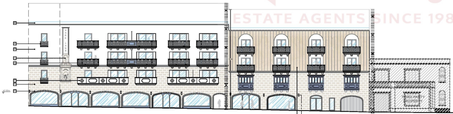
PROPOSED Elevation/Streetscape 1:200