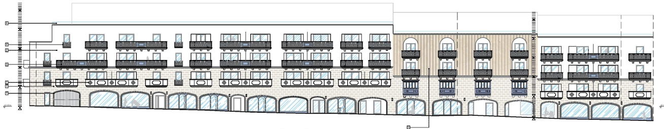
PROPOSED Elevation/Streetscape 1:200