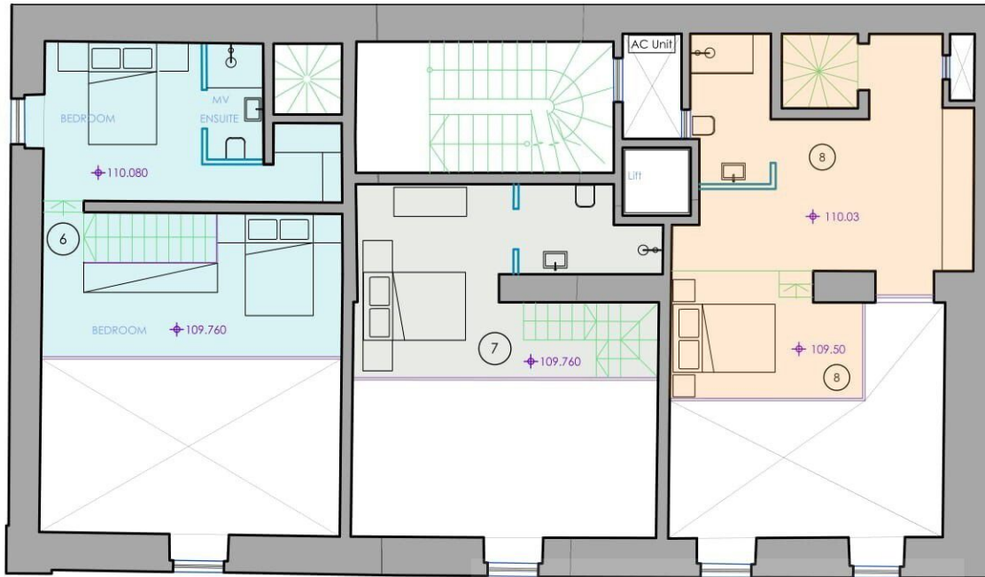
PROPOSED INTERMEDIATE (3.5)