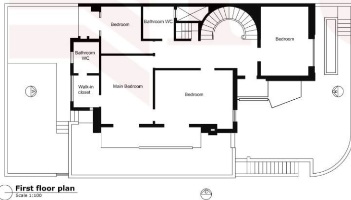
First floor plan Scale 1:100